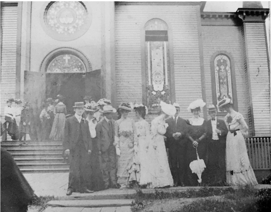
1909 wedding party in front of the old Saint Mary of the Angels Roman Catholic Church in Olean, NY. Photo courtesy of Olean Historical and Preservation Society

Basilica of St. Mary of the Angels Archives